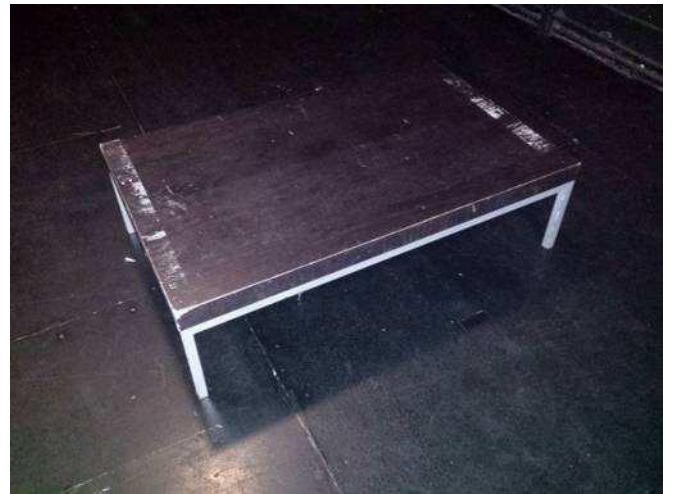
1 x wooden riser