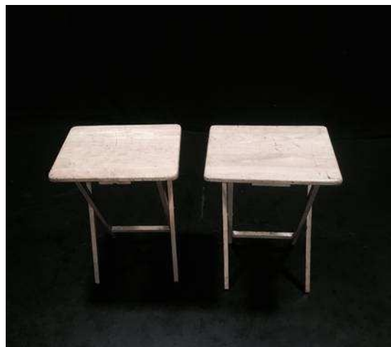
2 x folding light wooden tables