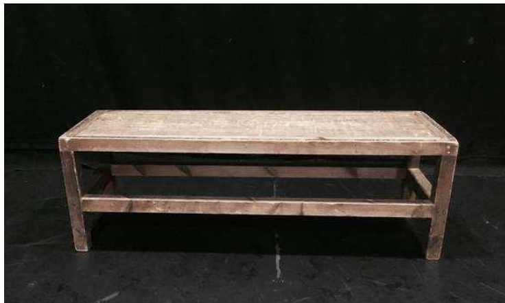
1 x wooden bench (L120cm; W35cm; H40cm)