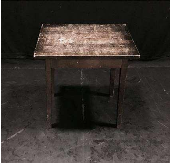
1 x dark wooden table