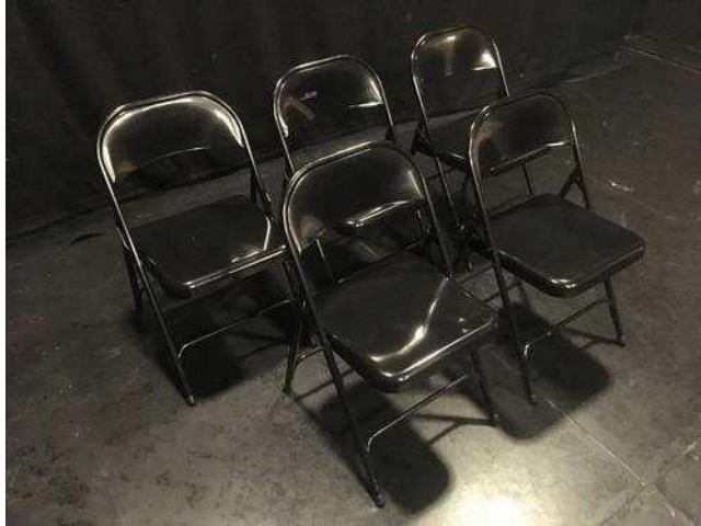
6 x black foldable metal chairs