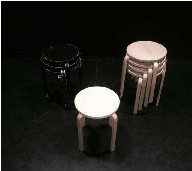
8 x small wooden stools