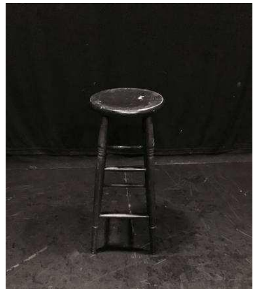
2 x high stool